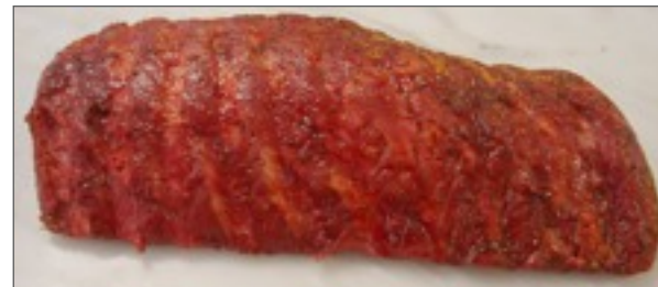
Mediterranean Thin Ribs