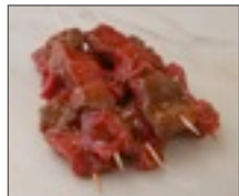
Sweet Chilli Beef