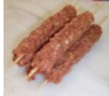
Lamb & Mint