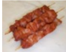
Chicken Kebabs in any Flavour you request