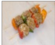
Lamb Curry & Pepper