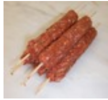
Mexican Chilli Beef