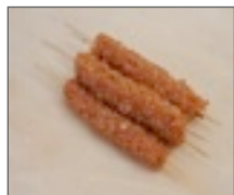
Shami Sheek Lamb